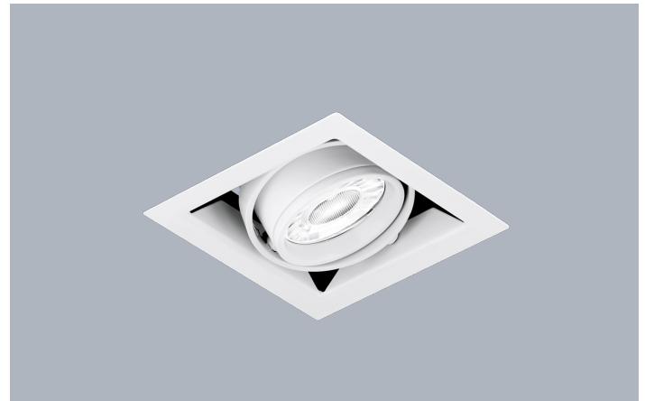
EDLM™ PRO GU10 Adjustable Single Multiple