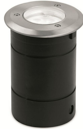
GU10 IP65 Fixed Round Walkover