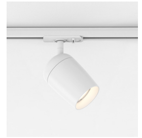
CODE: 1478012 FINISH: MATT WHITE

To maintain this product to its best condition, please view our care and cleaning guide on the support section of the astro website.