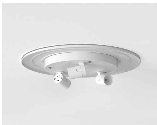
CODE: 1462002 FINISH: MATT WHITE

TO MAINTAIN THIS PRODUCT TO ITS BEST CONDITION, PLEASE VIEW OUR CARE AND CLEANING GUIDE ON THE SUPPORT SECTION OF THE ASTRO WEBSITE.