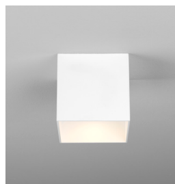
CODE: 1252028 FINISH: MATT WHITE