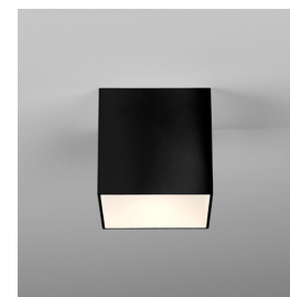
CODE: 1252029 FINISH: MATT BLACK

TO MAINTAIN THIS PRODUCT TO ITS BEST CONDITION, PLEASE VIEW OUR CARE AND CLEANING GUIDE ON THE SUPPORT SECTION OF THE ASTRO WEBSITE.