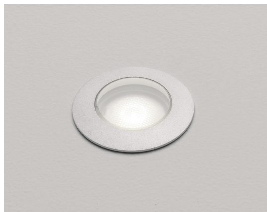
CODE: 1201002 FINISH: ANODISED ALUMINIUM

TO MAINTAIN THIS PRODUCT TO ITS BEST CONDITION, PLEASE VIEW OUR CARE AND CLEANING GUIDE ON THE SUPPORT SECTION OF THE ASTRO WEBSITE.