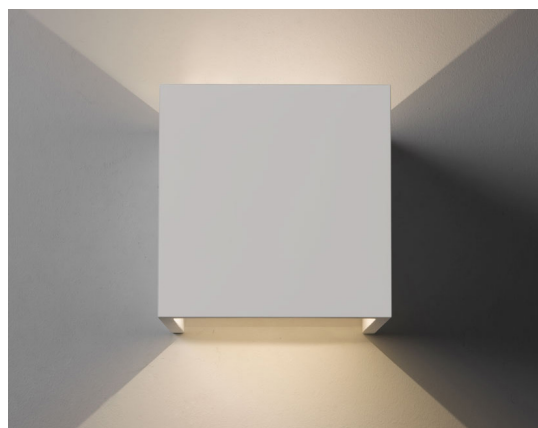
CODE: 1196002 FINISH: PLASTER

TO MAINTAIN THIS PRODUCT TO ITS BEST CONDITION, PLEASE VIEW OUR CARE AND CLEANING GUIDE ON THE SUPPORT SECTION OF THE ASTRO WEBSITE.