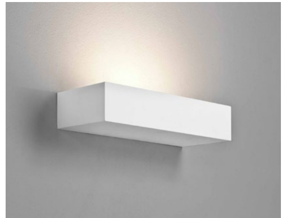
CODE: 1187005 FINISH: PLASTER

TO MAINTAIN THIS PRODUCT TO ITS BEST CONDITION, PLEASE VIEW OUR CARE AND CLEANING GUIDE ON THE SUPPORT SECTION OF THE ASTRO WEBSITE.