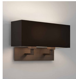
CODE: 1080048 FINISH: BRONZE

TO MAINTAIN THIS PRODUCT TO ITS BEST CONDITION, PLEASE VIEW OUR CARE AND CLEANING GUIDE ON THE SUPPORT SECTION OF THE ASTRO WEBSITE.