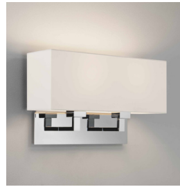
CODE: 1080019 FINISH: POLISHED CHROME